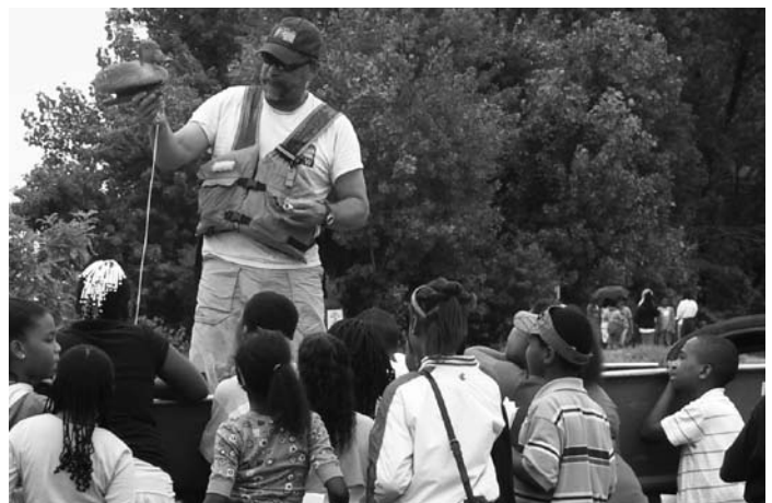
Students get a hands-on look at shovelnose sturgeon at the Missouri River Watershed Festival at La Benite Park in Sugar Creek, MO.