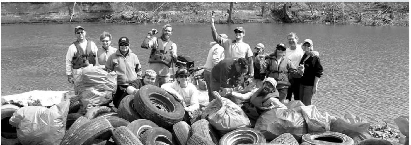
Missouri River Relief crew and Bayer Crop Science employees celebrate a successful Project Blue River Rescue.